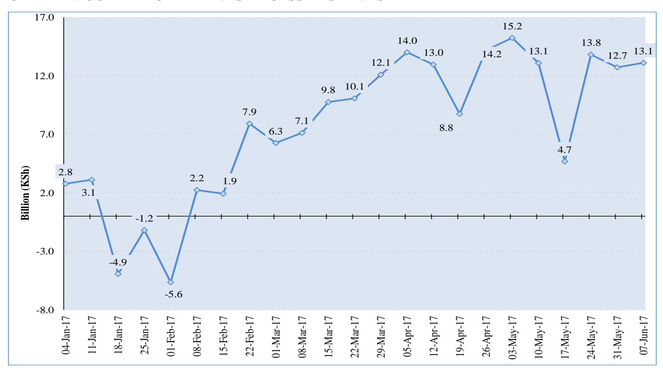
CHART A: COMMERCIAL BANKS EXCESS RESERVES